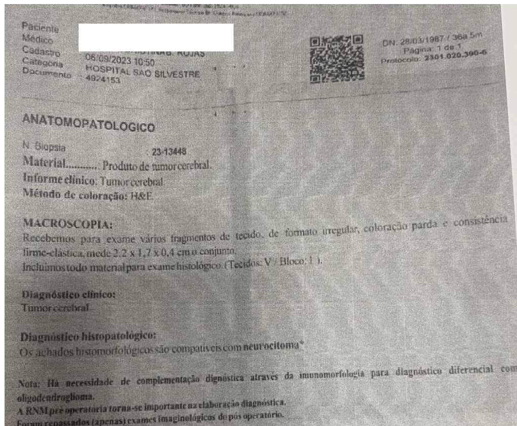
Figure 3: Biopsy of brain tumor confirming the histological finding of neurocytoma.

The anatomic pathology study of the surgical specimen identified a tumor with proliferation of small, round, cohesive, isomorphic and diffuse cells, with signs of previous hemorrhage. Immunoreactivity indicated central neurocytoma.